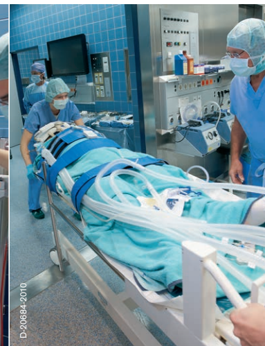
Induction Room Induction of anaesthesia in a patient before entering the Neurosurgical MRI-OR