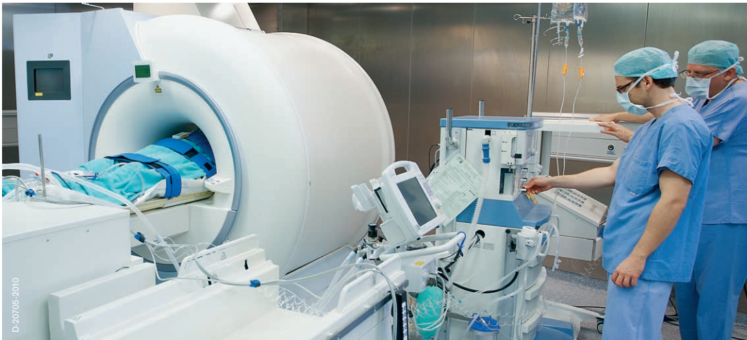
Neurosurgical MRI-OR Anaesthesia maintenance phase. Patient monitoring during MR sequences (Anaesthesia Device, Patient Monitor, Syringe Pumps)