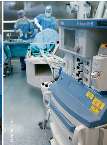
Anaesthesia maintenance phase Fabius MRI in use during neurosurgery procedure.