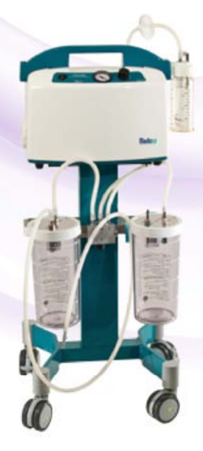
Mobile VACUMED with reusable 2 liter jars