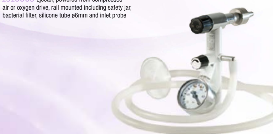
1700013 Ejector, powered from compressed air/oxygen drive, directly including bacterial filter, silicone tube ø6mm and inlet probe

1510003 Ejector, powered from compressed air or oxygen drive, rail mounted including safety jar,