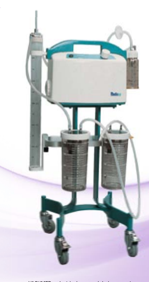
\label{lem:VACUMED-electrical} \textbf{VACUMED-electrical powered drainage system}