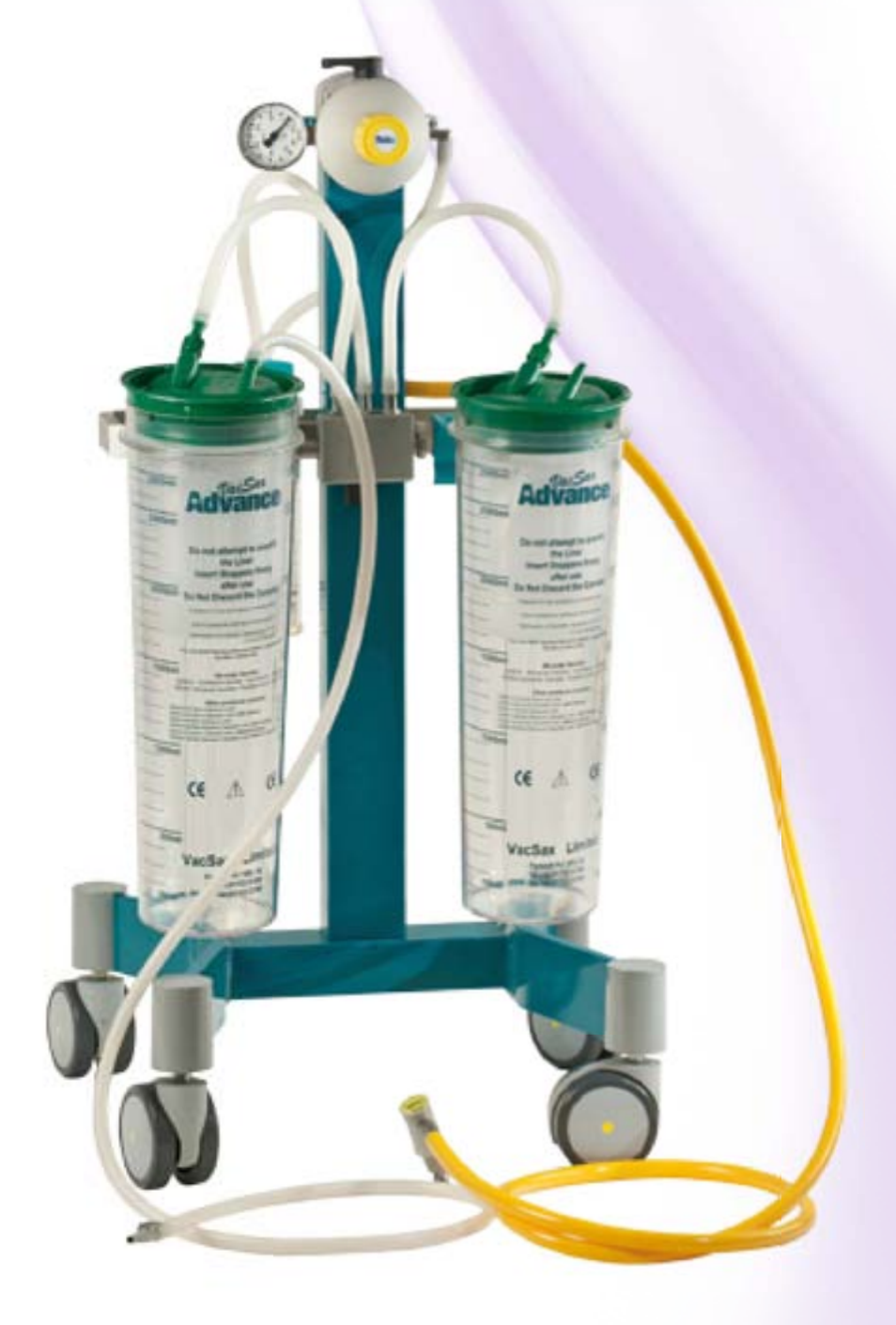
1540002 Mobile suction unit, vacuum powered, complete with two suction jars by choice (reusable suction jars: from 1000 to 4000 ml or suction bags for single use: from 2000 ml to 3000 ml), safety jar, bacterial filter, trolley with a jar carrier including antistatic wheels and all necessary tubes and inlet connector