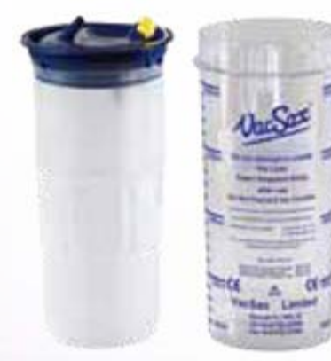
1550047 Suction bag for single use 2000 ml