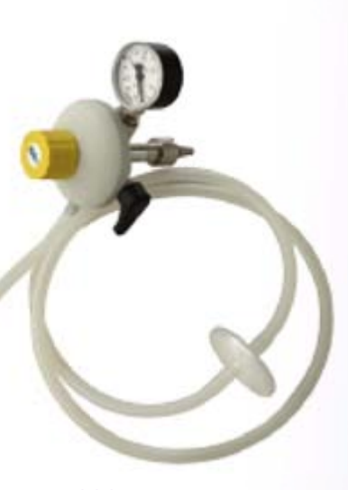
1510005 Vacuum regulator (0 to -1.0 bar), directly, including bacterial filter, silicone tube ø6 mm and inlet probe

1510004 Vacuum regulator (0 to -1.0 bar), rail mounted, including safety jar, bacterial filter, silicone tube ø6 mm and inlet probe