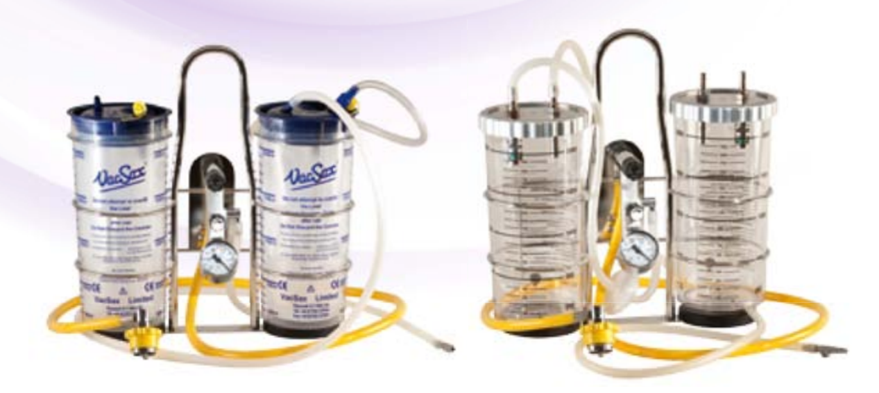
1550001 Portable suction unit with two bags for single use and rail bracket, vacuum poweredcomplete with all tubes, filters and inlet connector

German, French, British, Italian, Japan, Australian