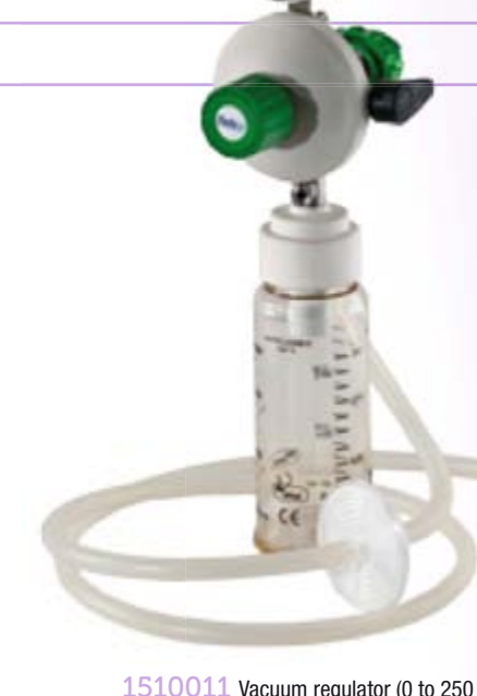
1510011 Vacuum regulator (0 to 250 mbar), directly, including safety jar, bacterial filter, silicone tube ø6 mm and inlet probe