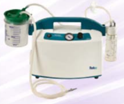
Portable VACUMED with disposable bag - 1 liter