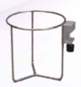
1700012 Rail carrier for suction jar, 4000 ml