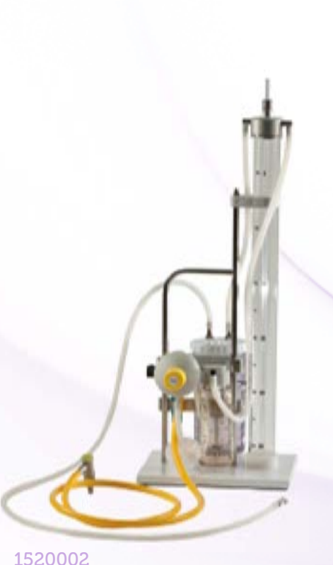
1520002 Portable permanent drainage, vacuum powered

1530001 Rail mounted permanent drainage, compressed air powered