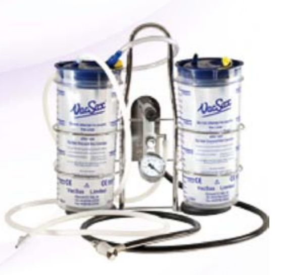
1550000 Portable suction unit with two bags for single use , compressed air/oxygen powered complete with all tubes, filters and inlet connector