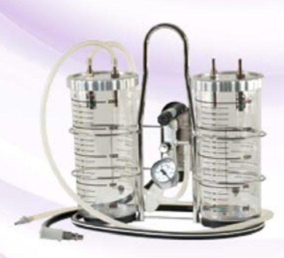
1500001 Portable suction unit with two reusable suction jars and rail bracket, compressed air/oxygen powered, complete with all tubes, filters and inlet connector

German, French, British, Italian, Japan, Australian