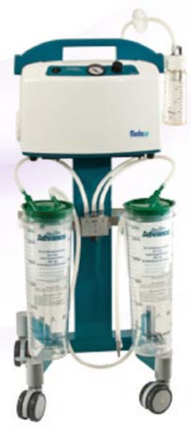
Mobile VACUMED with disposable bags - 3 liter