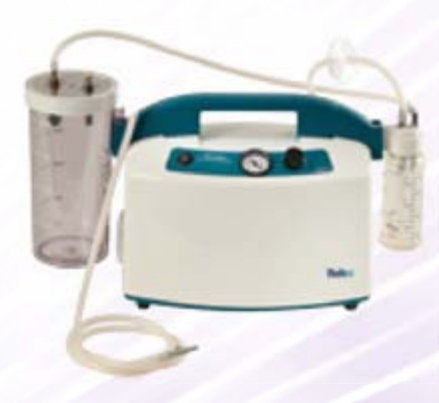
Portable VACUMED with 2 liter jar