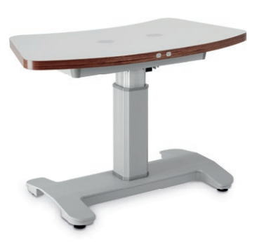
37450 Ophthalmic table for two devices, delta-shaped tabletop