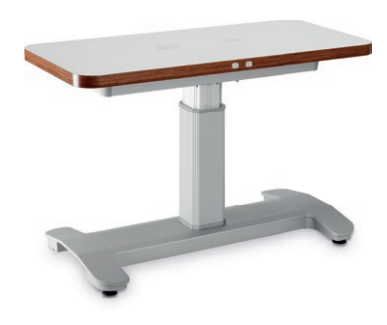
37460 Ophthalmic table for two devices, symmetrical

37475 Identical to 37460, but with 37485 different tabletop sizes