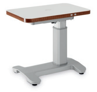
37430 Ophthalmic table for one device, asymmetrical