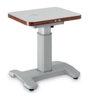
37420 Ophthalmic table for one device, symmetrical

OCULUS Ophthalmic Tables catch the eye with their distinctive design. Their multiplex tabletops with state-of-the-art high pressure laminate (HPL) give them a classy, aesthetic appearance. The HPL coating is highly resistant to chemical and thermal influences. The smooth surface is characterized by extreme strength and durability – making it just perfect for use in the medical field.