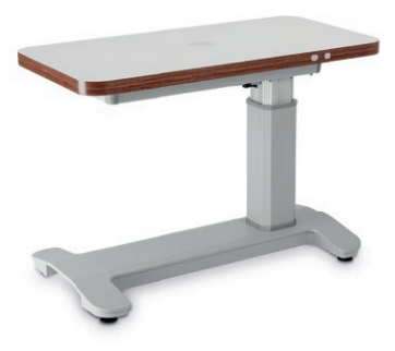
37440 Ophthalmic table for one device, asymmetrical, wheelchair-accessible