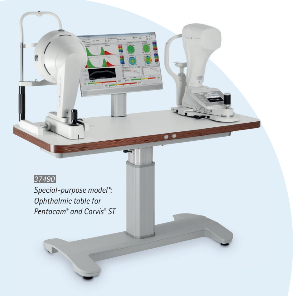
* Further special-purpose tables are available for various OCULUS devices. Please contact your local distributor for details.