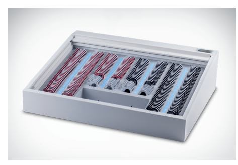
Always the right trial lens at hand OCULUS offers a variety of lens cases ranging from the standard model to large cases including numerous special trial lenses.

Optimized arm inclination range: upward: 25°, downward: 12°