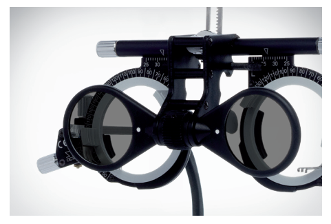
Optional polarizing filter (by Hegener) Linear (45°/135°), reversible, with generous viewing area for distance and near vision. Attaches to cross-bar for easy mounting.